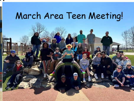
March Area Teen Meeting!